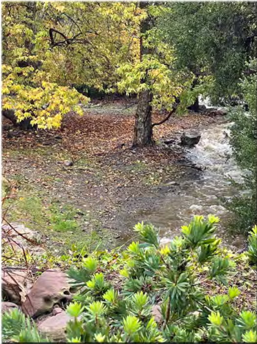
Stream flowing in the Nature Park