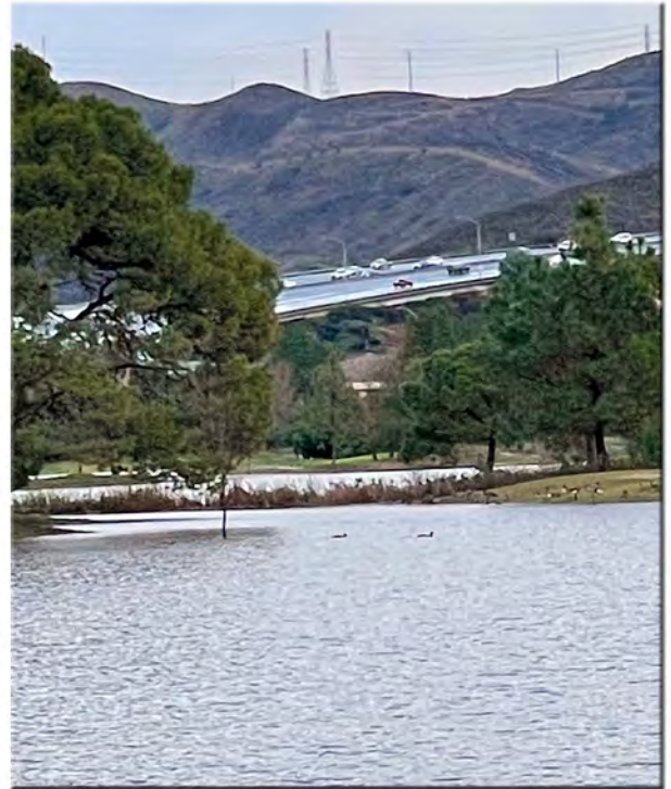
From the end of Irena in CCV looking across “the lake” to the 101 freeway by Lorraine Villarreal