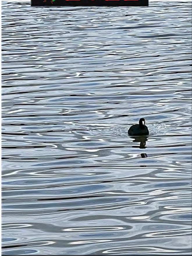
A coot enjoying the water by Lorraine Villarreal