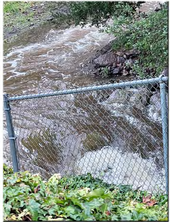
Stream coming from waterfalls and then flowing under San Como Lane