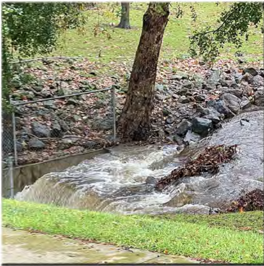
Stream leaving the Nature Park and going under Irena to the golf course