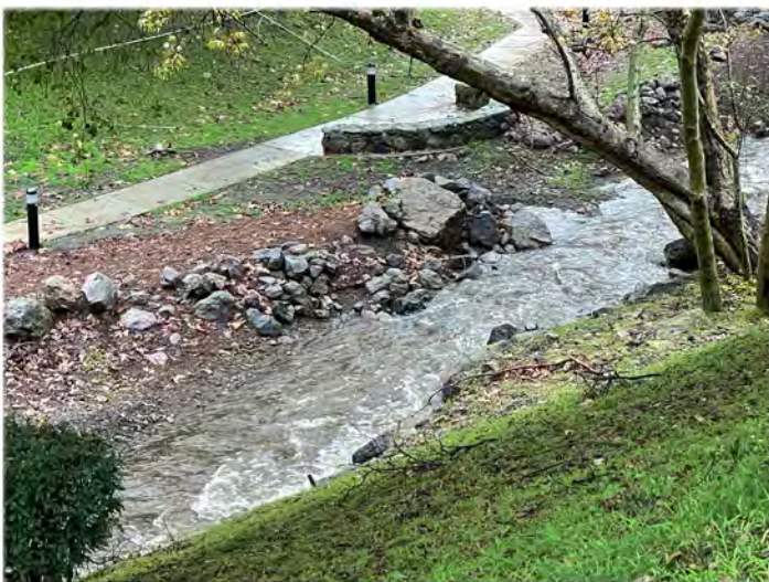
Waterfall at the top of San Como Lane